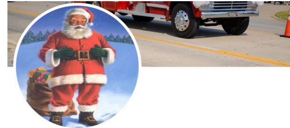
Santa's Toy Shoppe of Eastern Canadian County